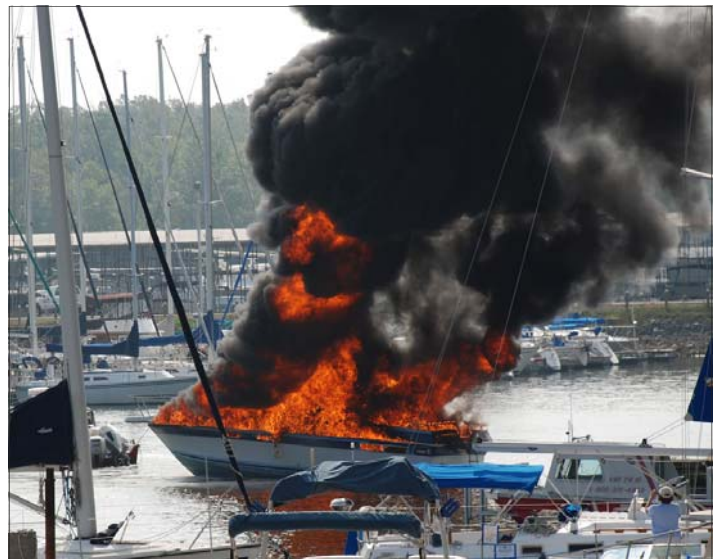
The burning boat is towed away from other boats.